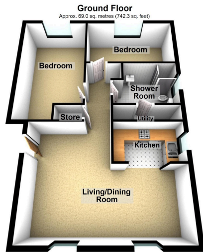
Total area: approx. 69.0 sq. metres (742.3 sq. feet)