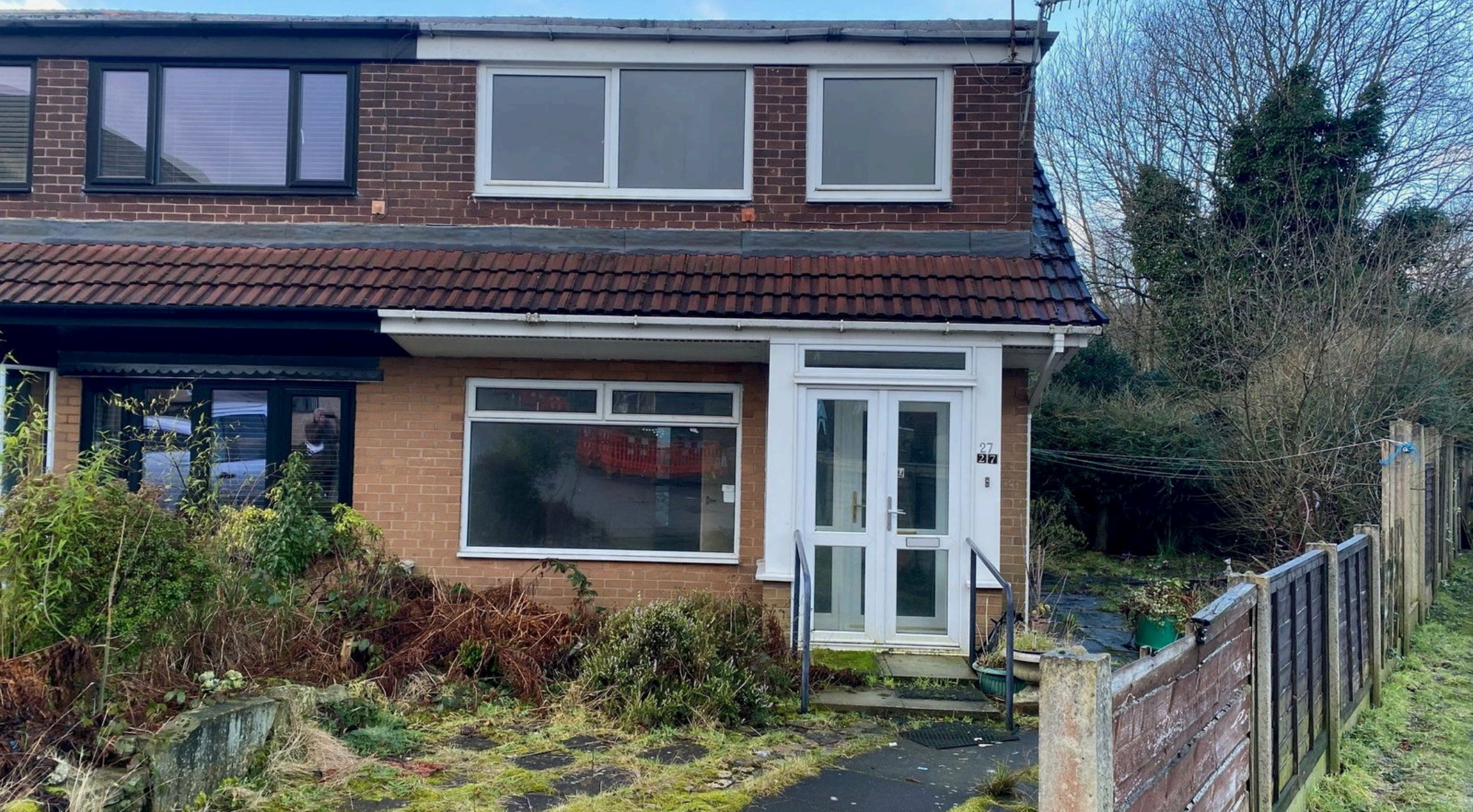
27 Quick View, Mossley, Ashton-under-Lyne